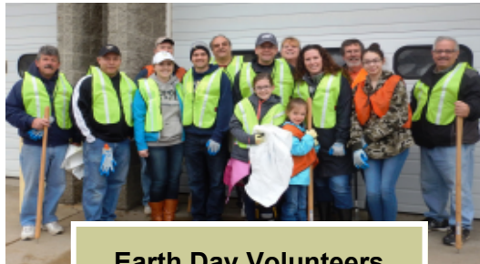
Earth Day Volunteers

On April 25th, Neville Island celebrated Earth Day. Thanks to all Earth Day volunteers. Over 200 bags of trash collected from Neville Road and Grand Avenue. Bags, vests, gloves supplied by Township and DTE Energy/Shenango. Catered lunch was solely sponsored by DTE Energy/Shenango.